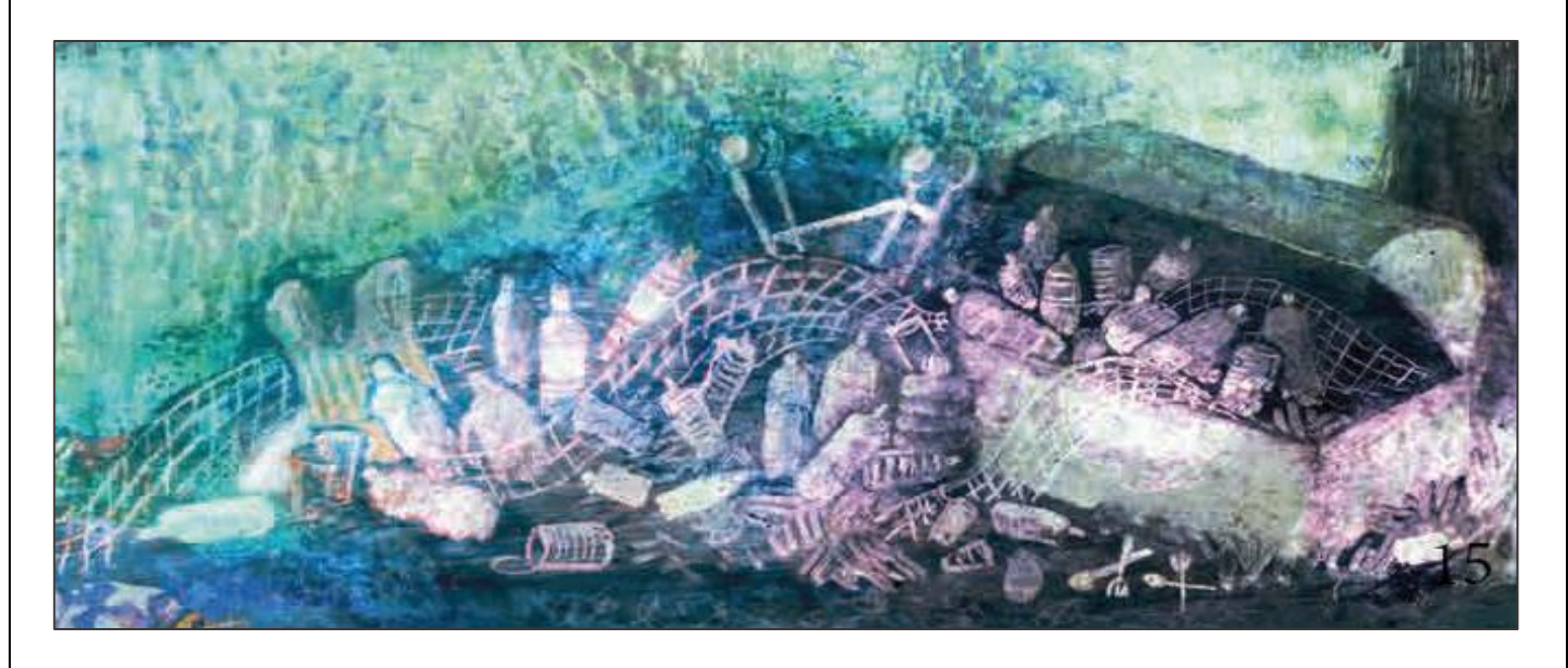
The Tale of the Whale by Karen Swann and Padmacandra. Activity Sheet 'Ocean Treasure'

Who do you think the crew members were? How many were there? What jobs did they do? Give them all names. What adventures have they been on and what lands have they travelled to? What sea creatures have they met? Have they seen mermaids? What treasures have they found? Can you write a story about them and their adventures or perhaps tell us why their ship is on the bottom of the sea!